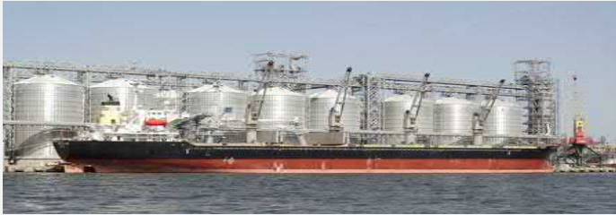
COFCO Agri (China)