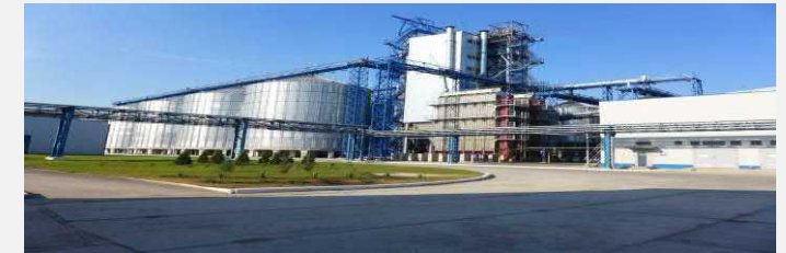
Delta Wilmar (Ukraine)

Modernization of production in order to switch to soybeans: development of design documentation, manufacture and supply of switchboard equipment for power supply systems.